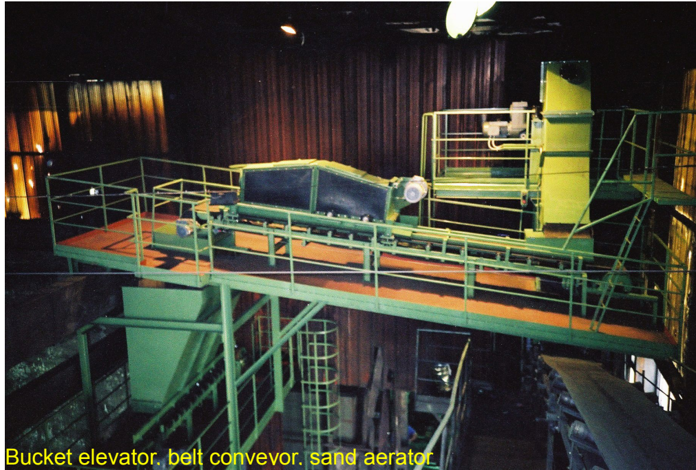
Bucket elevator, belt conveyor, sand aerator