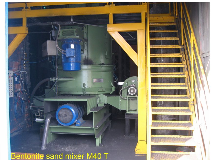
Bentonite sand mixer M40 T