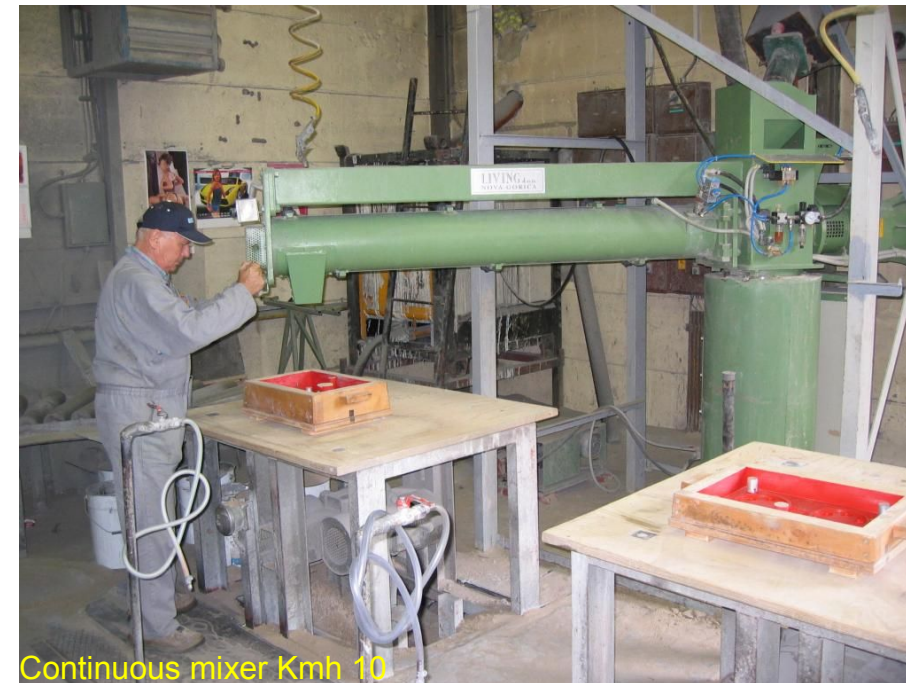
Continuous mixer Kmh 10