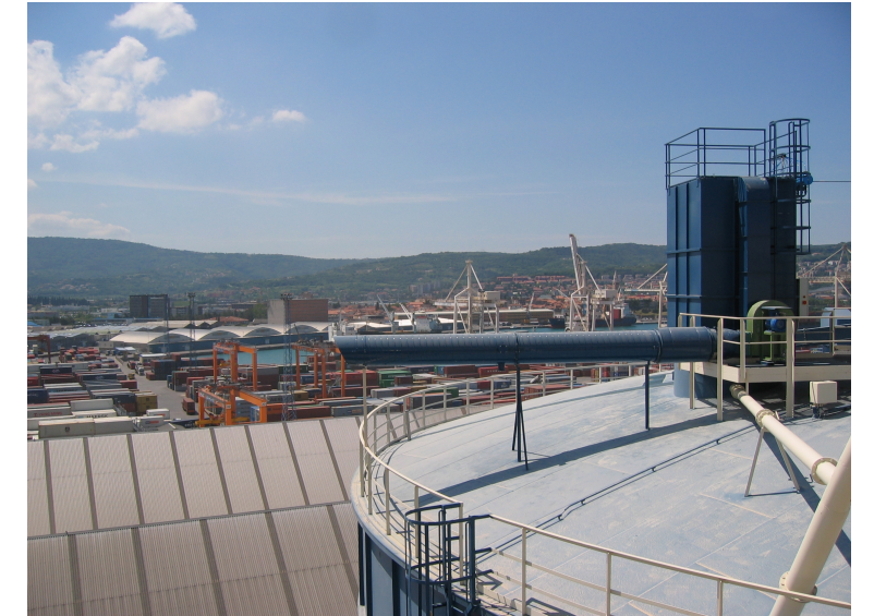
Dust collector FVS 3,0-144-176 Capacity 15.000 m 3 /h