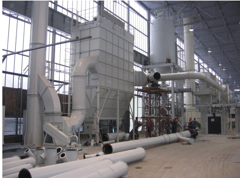
Dust collector IKV 4,0-240-387 Capacity 35.000 m 3 /h

Dry bag fabric filters with preseparating chamber Bags cleaning with compressed air injection