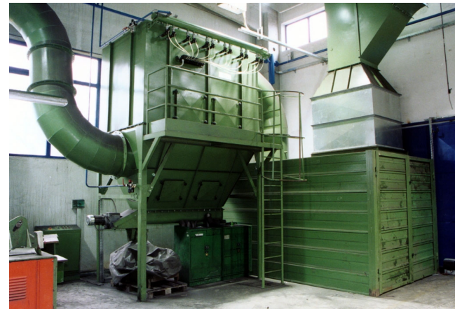
Cartridge Dust collector PF-24 Capacity 25.000 m 3 /h