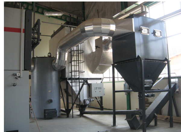
Dust collector IKV 3,0-160-196-PT Capacity 10.000 m 3 /h (200 °C)