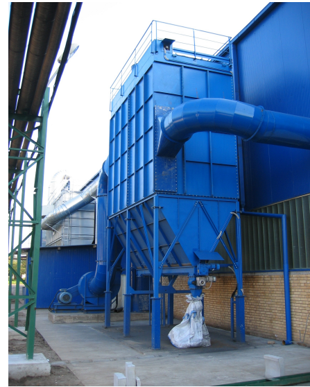
Dust collector IKV 4,0-240-387 Capacity 35.000 m 3 /h