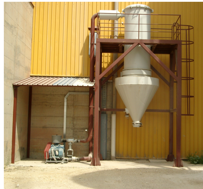
Vacuum cleaner VC-800 Capacity 800 m 3 /h