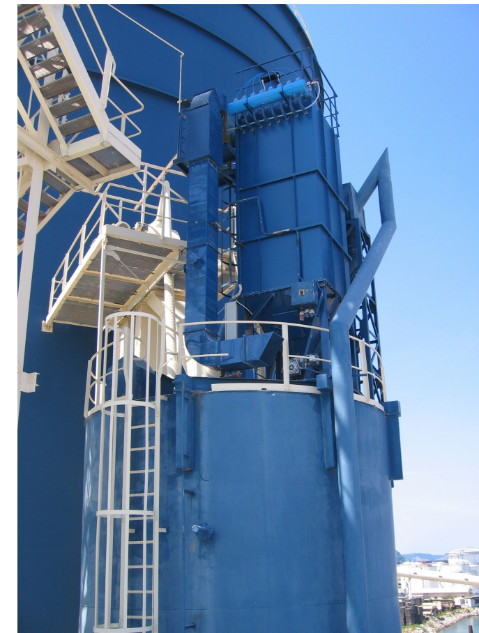
Dust collector FVL 3,0-64-78 Capacity 5.000 m 3 /h