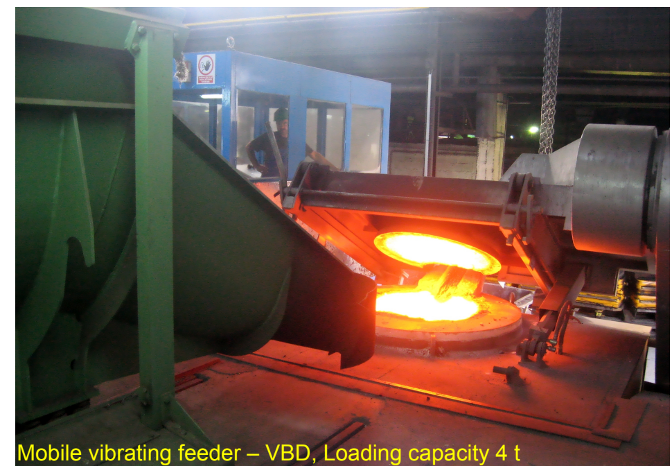
Mobile vibrating feeder – VBD, Loading capacity 4 t