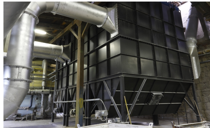
Dust collector IKV 3,4-200-278-PT Capacity 18.000 m 3 /h (250 °C)