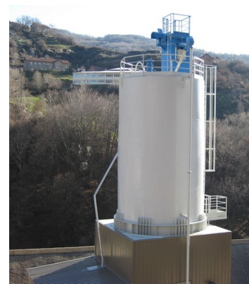
Dust collector FVS 2,0-36-29 Capacity 2.500 m 3 /h