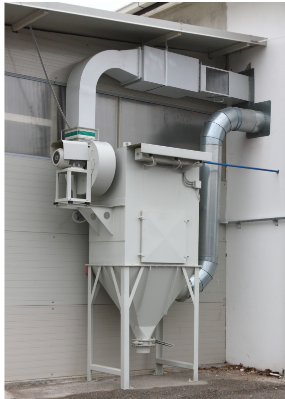
Cartridge Dust collector PF-6 Capacity 5.000 m 3 /h

Dry cartridge filters with compressed air injection cleaning