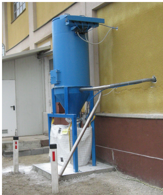
Vacuum cleaner VC-400 Capacity 400 m 3 /h