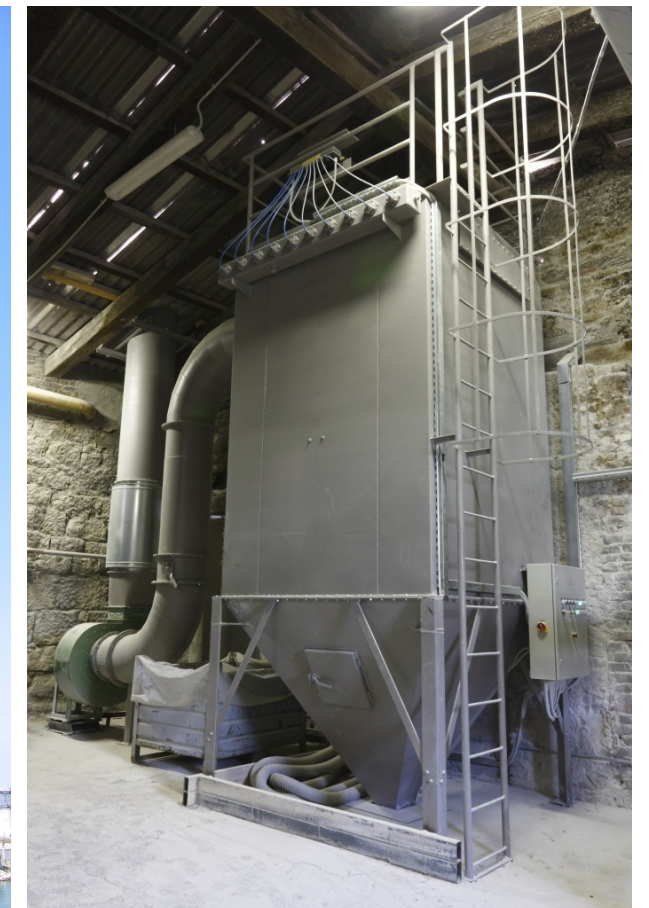
Dust collector FVL 2,4-100-98 Capacity 10.000 m 3 /h