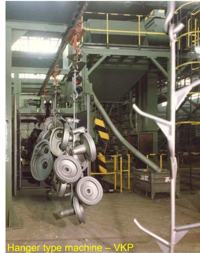
Hanger type machine – VKP