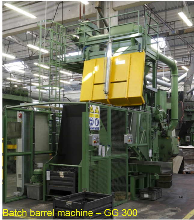
Batch barrel machine – GG 300