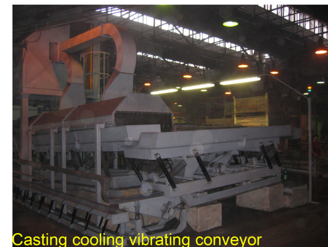
Casting cooling vibrating conveyor