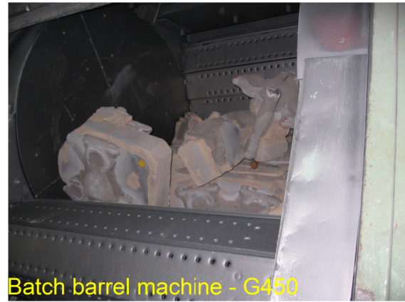
Batch barrel machine - G450