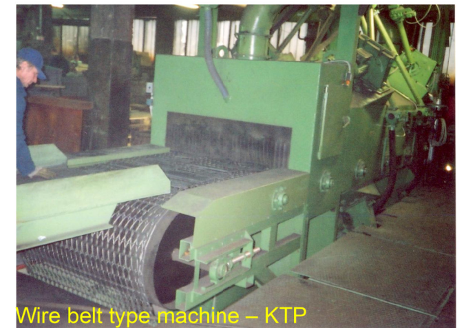
Wire belt type machine – KTP