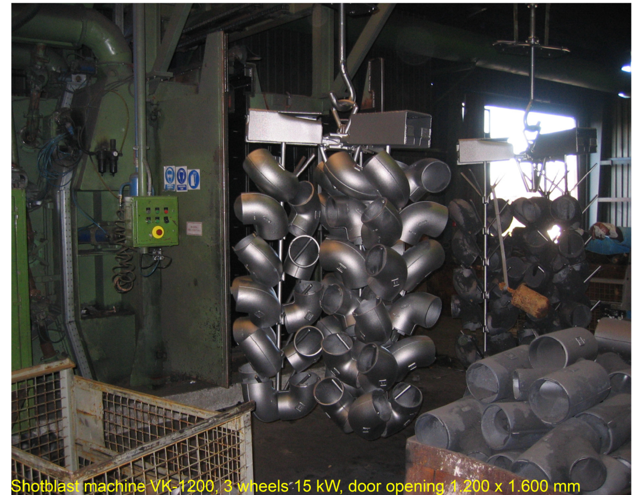
Shotblast machine VK-1200, 3 wheels 15 kW, door opening 1.200 x 1.600 mm