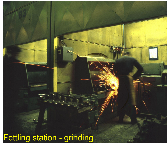
Fettling station - grinding