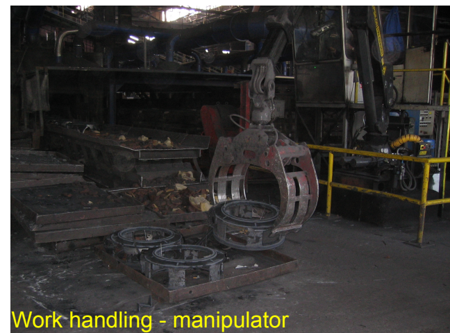
Work handling - manipulator