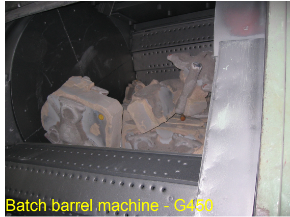
Batch barrel machine - G450