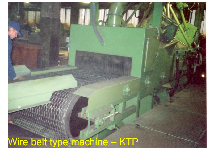
Wire belt type machine – KTP